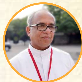
Bishop Malcolm Sequiera Diocese of Amravati